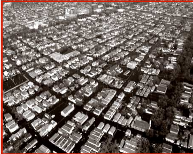
Hurricane Katrina: week two.

made payable to AJLI and note JL Disaster Fund on the check.