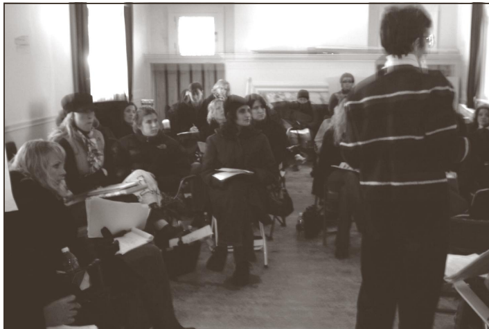
Sixty JLP members braved the cold weather both outside and inside the 18th Designers' Show House currently under renovation to attend Media Relations training on Saturday February 3, 2007.

Comcast Newsmakers is a free forum for nonprofits to present events and issues important to Western Pennsylvania.