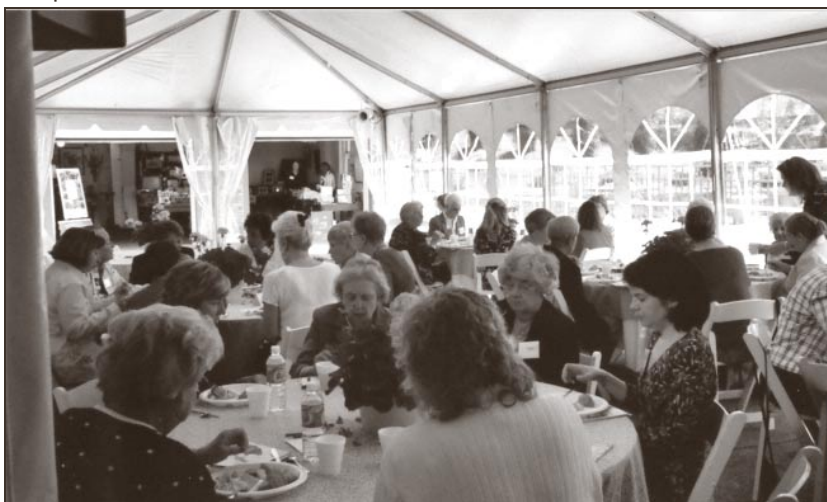
Sustainers enjoying the day at Show House at the luncheon.