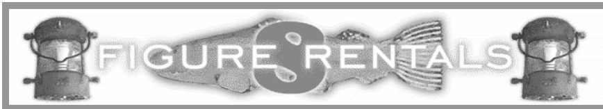
Figure 8 Island Wilmington, NC Cottage Rentals

Thank you in advance for your participation!