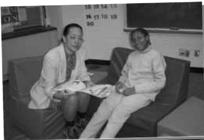
Students are matched one-to-one with JLP volunteers.