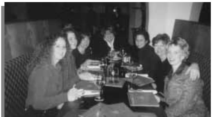
A whole bunch of fun people out for dinner in Seattle.