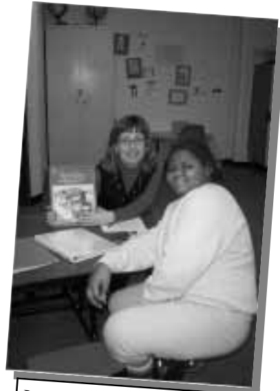
Junior League Power Lunch volunteer with EW! student