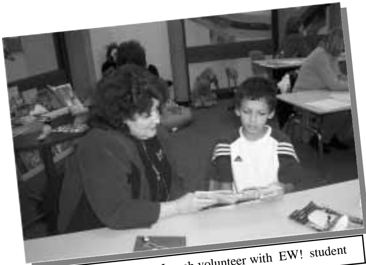
Junior League Power Lunch volunteer with EW! student