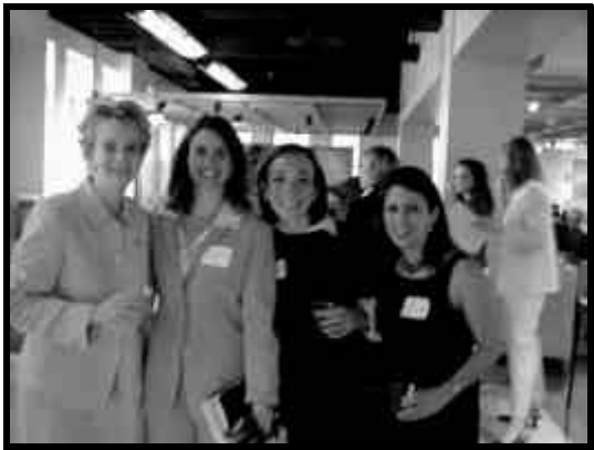
JLP members socializing with prospective members.

Approximately 60 prospective new members attended, together with about 20 current JLP members – all who mixed and mingled with great enthusiasm. Tasty morsels from the Pennsylvania Macaroni Company and refreshing cold beverages added to the festive atmosphere.