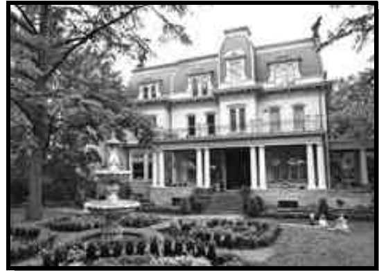
2003 Designer's Show House: 5061 Fifth Avenue Shadyside

The JLP's Show House celebration began at the Hard Hat Party in April, where 200 + JLP members and guests enjoyed beer and BBQ on the porches of the Gwinner-Harter Mansion