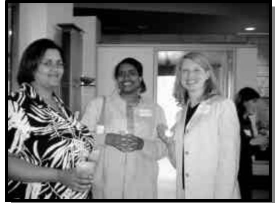
JLP members socializing with prospective members.

In addition, prospective members received new member information packets and heard details of the upcoming provisional calendar of events. We feel confident that the event was a success as we received extremely positive feedback from attendees on the surveys they completed as they exited. Responses included such comments as "fantastic women," and "great impression of the Junior League of Pittsburgh." On behalf of the Membership Development Committee, thanks to all who attended and referred prospective members to the League.