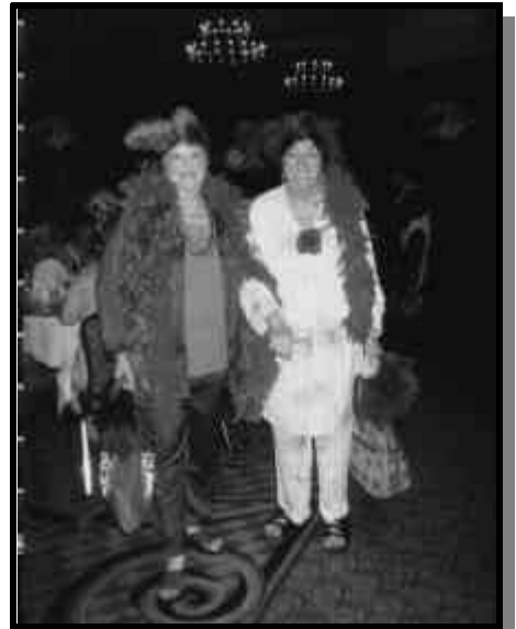
Red Hat ladies

These women are over fifty years old, wear purple garb with red hats (including sequins and boas). Their motto is "the only rule is no rules." I kept saying that when I grow up, I want to be a member. They were a riot!