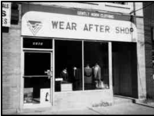
4707 Liberty Avenue: Original location of the Shop

On August 15 th we'll close the doors at our 4707 Liberty Avenue location for the last time. Expect an early September grand opening right down the street at 4752 Liberty.