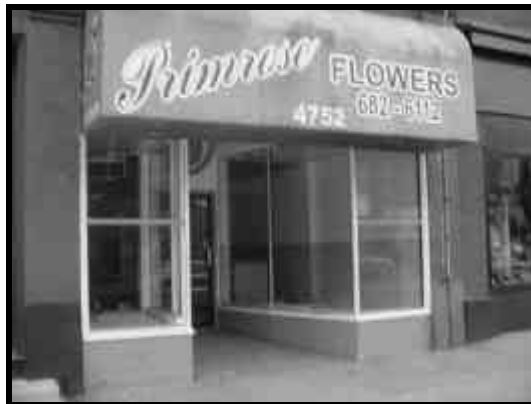
4752 Liberty Avenue: Future Home of the JLP's Wear After Shop

those with experience, interest in retail, or interest in the success of the Wear After Shop in general.