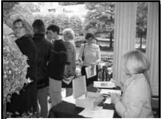
Guest patiently wait to tour the 2003 Designer's Show House.

All of the additional days were consumed by hard work on the part of contractors, designers and JLP Show House committee